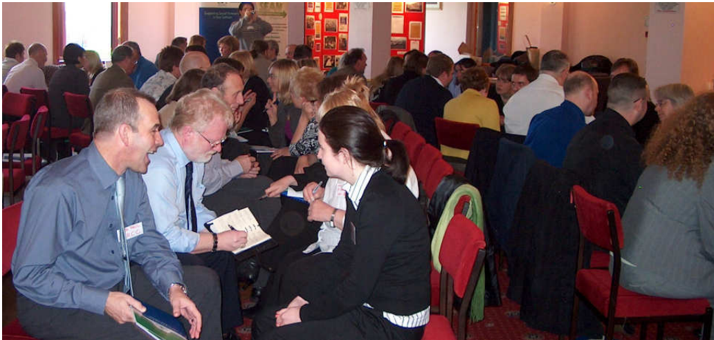
Meet the Buyer Speed Networking

There were a number of suggestions by LSEP representatives, and from the delegates themselves on the day, as to why there had not been a greater uptake by social enterprises. East Lothian had had a similar event the previous year, which may have impacted on enterprises willingness to attend from this area. The emphasis on 'procurement' may also have discouraged smaller organisations from attending. However, the biggest, and most intractable, problem is the difficulty of social enterprise managers taking time away from direct service delivery to attend events such as Meet the Buyer.