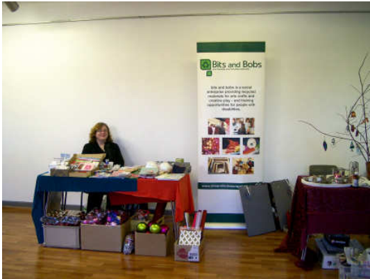
Bits and Bobs stall

A full range of the goods on sale and the beneficiaries is to be found in the Catalogue in Appendix B.