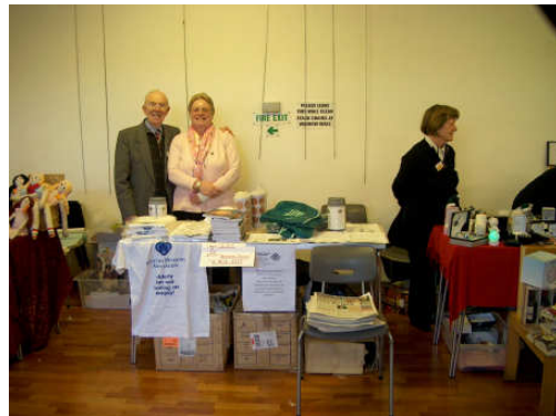
Scottish Pensioner's Association stall

In addition, this was the first time that such an event had been held by SEAM, and valuable lessons were learned that could feed into an improved event next year. For SEAM, the event provided a useful way of stimulating awareness of local social economy organizations, which is one of SEAM's key aims.